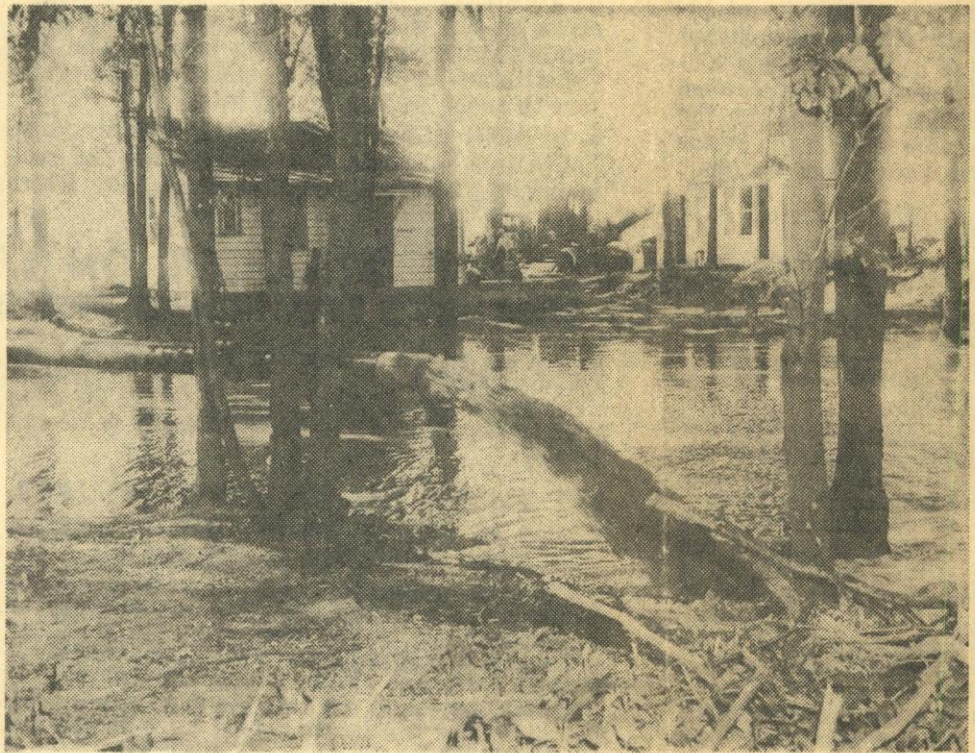
MARSHY AREA FILLED UP BY LAKE DREDGING: Clay, sand and water sucked up by dredge is dumped in this low-lying area behind cottages at Graham beach on Big Cedar lake. About 6,500 cubic yards of earth will be dredged from lake cove exposed when water receded. Cottages received permit for work from State Water Resources Commission and other exposed areas of the lake may be dredged out in the future.